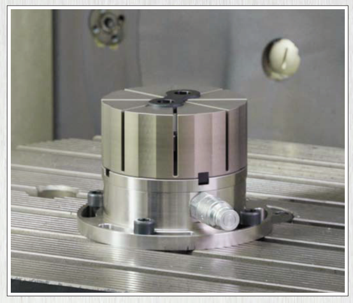
Subject to technical alterations.